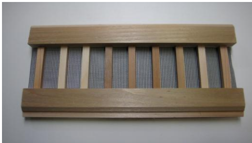
CEDAR 6 INCH STYLE 95

Our SOFFIT VENTS are made from kiln dried premium wood products, and come in two basic styles, two different sizes, and four different wood types: Western Red clear and stk cedar, pine or fir, as well as combination of fir rails with pine centers.