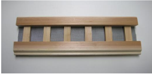
CEDAR 4 INCH STYLE 64