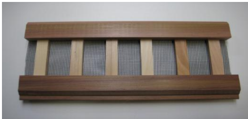
CEDAR 6 INCH STYLE 64