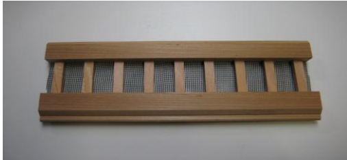
CEDAR 4 INCH STYLE 95